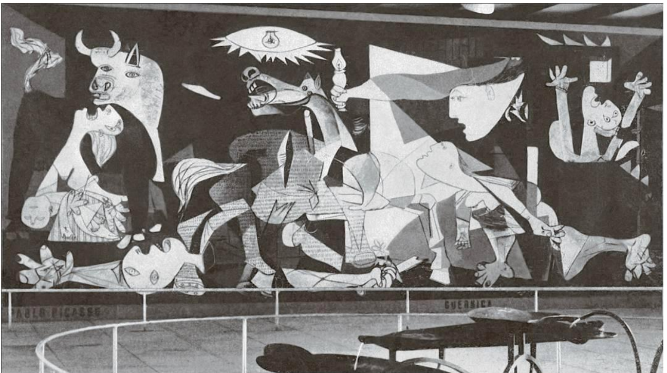
Guernica in situ in the Spanish Pavilion at the World Fair, Paris, 1937.