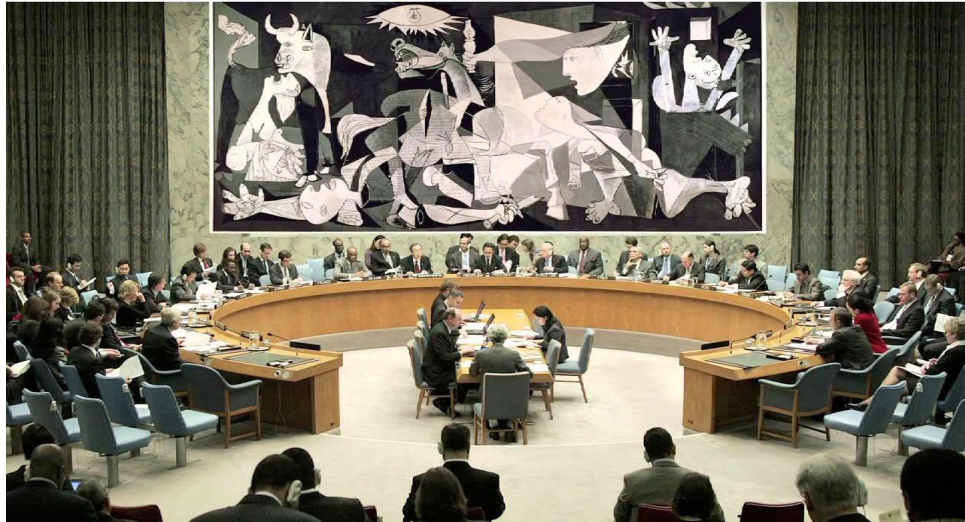
Guernica tapestry in the United Nations, 1985.